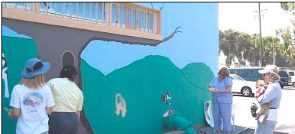
Working or watching - the Portrait Wall was a popular location during Puppy Luv Adoption Day